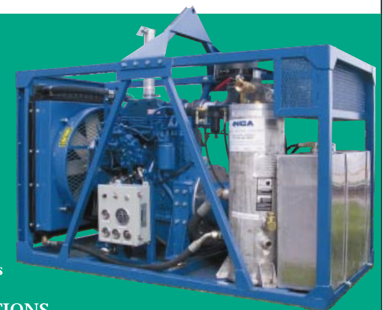
Bush Guard, Rigid Frame and Fuel Tank

PROVIDING INNOVATIVE SOLUTIONS TO CUSTOMERS ON EVERY CONTINENT