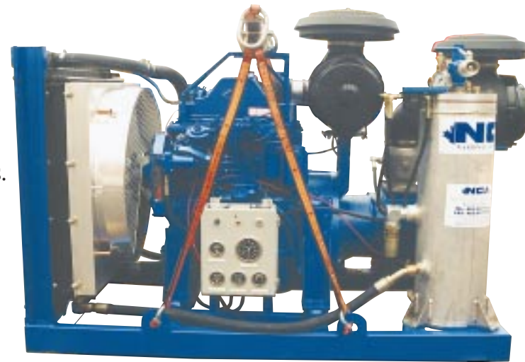
Skid-mounted Heli Portable Compressor

Whether it's the jungles of South East Asia, the mountains of South America or the Canadian Arctic, our design excellence and equipment reliability have been proven by years of first hand field experience.